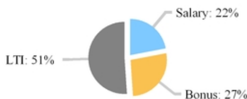
Target Mix: Peer 50th %ile