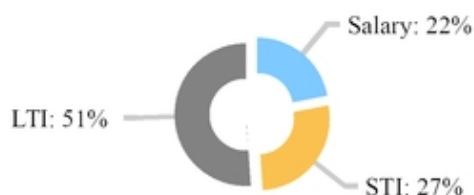
Target Mix: Peer 50th %ile