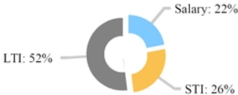
Target Pay Mix: NNN NEOs